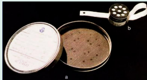
Radon test kit materials.